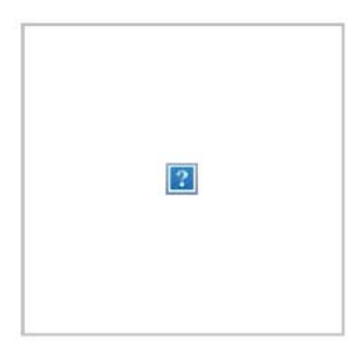
"It is what it is. But, it will be what you make it." ^{\sim} Pat Summit