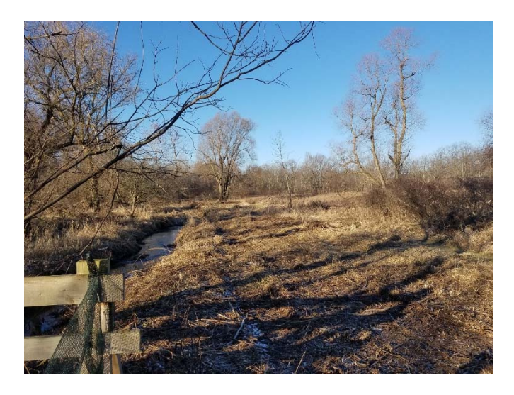
Peppermint Creek ditch before and after clearing. (Looking west towards the river)