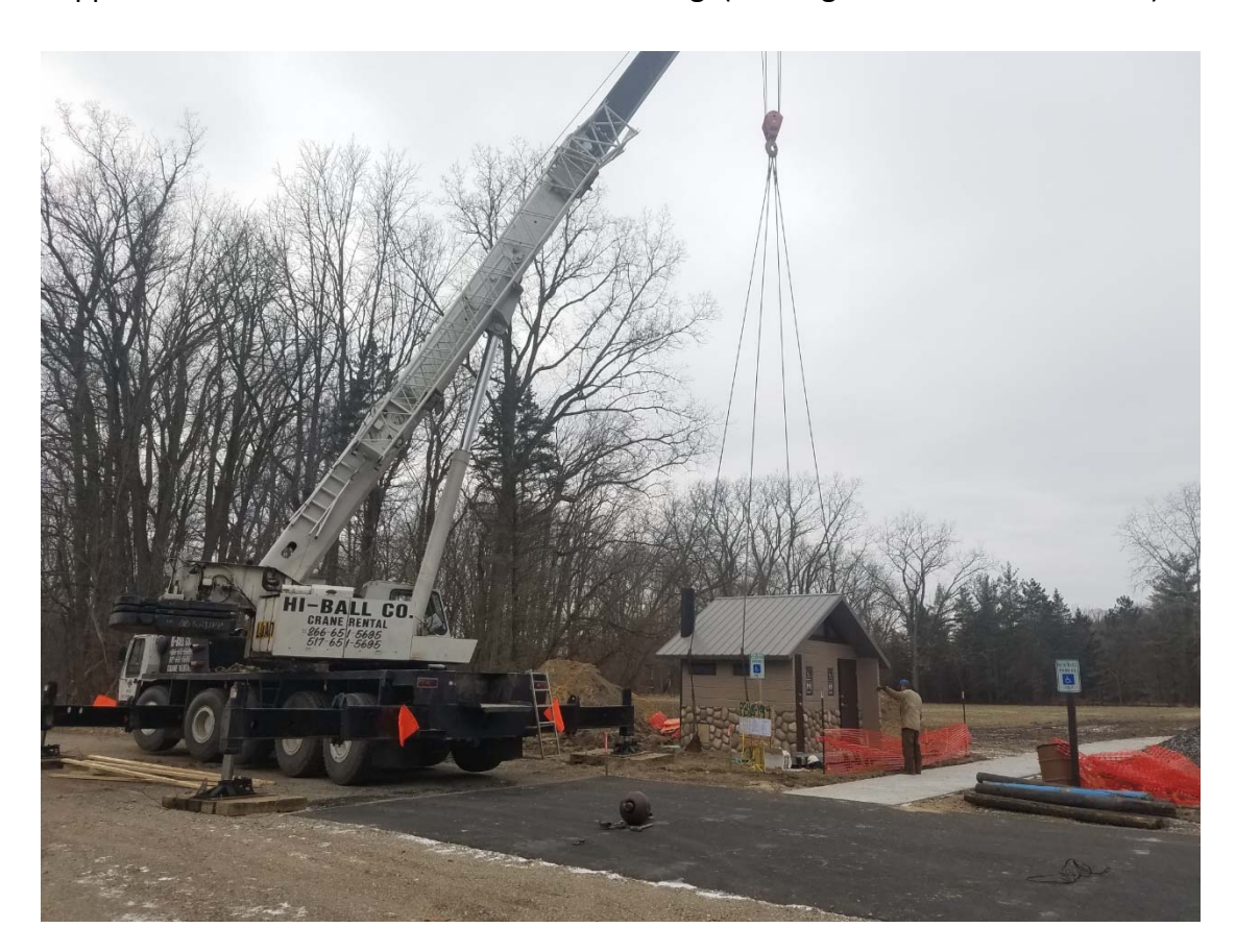
CXT restroom building being installed near Overlook shelter.