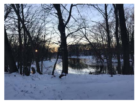
Grand River, Burchfield Co. Park