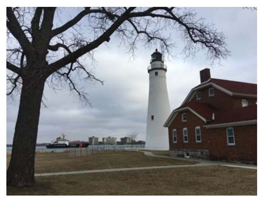
Fort Gratiot Light-Port Huron, MI