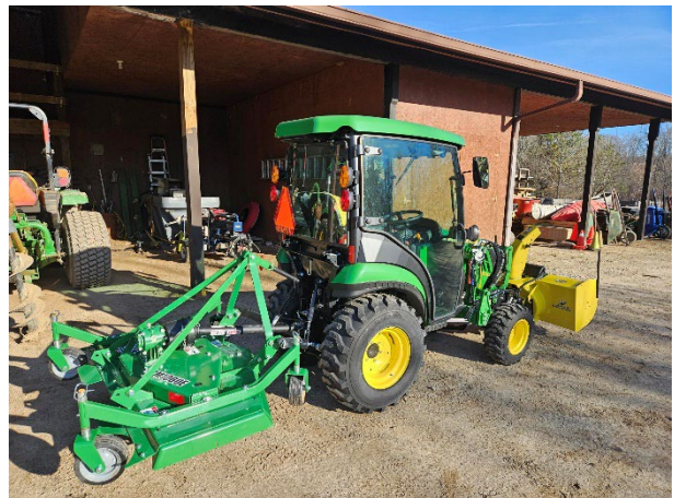
New Trail Mower/Tractor