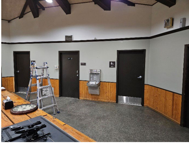
Fresh Coat of Paint on WSB Walls