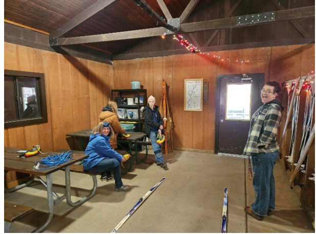
Cross Country Ski Rental Training