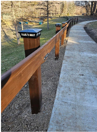
New Walkway Railing