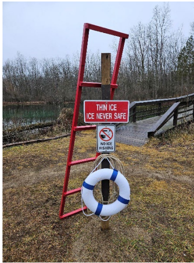
Ice Rescue Equipment