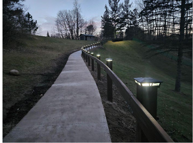
Solar Lighting Caps