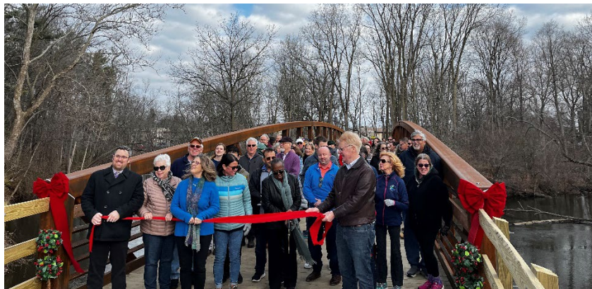
12/8/23 Ribbon Cutting MSU to Lake Lansing phase 1